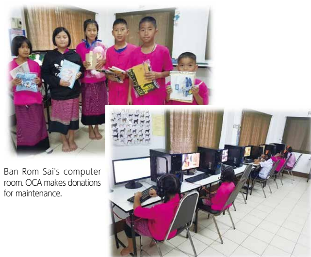
Ban Rom Sai's computer room. OCA makes donations for maintenance.

Our hope is that the Corona disaster will soon be over and lively reading events can resume.