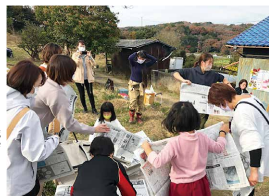
Bags for used toilet paper, made from newspaper, for using the waterless toilet. In lieu of flushing, put used paper in these bags and throw them away.