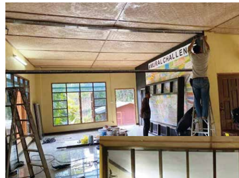
The room is fitted with glass dividers and doors, and has panel stated "donated by OCA and OCA Thailand" .

The children are now doing homework, doing research, and studying each on his or her own computer -- provided by you. We eagerly anticipate the wider range of knowledge they will now have access to.