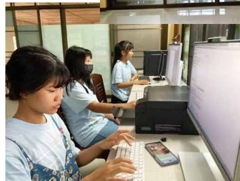
Children studying at their newly provided computers.