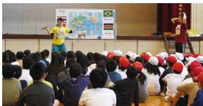
Records of School Project

To make it easier for children that are shy about dancing, or perhaps are limited by disability, to participate, there is space in the program for children to express themselves through other media – the emphasis being on learning through fun. The result was a shared experience of moving minds and moving bodies, with a wealth of self-expression opportunities. As one teacher put it, "for children who have so little opportunity to actually come into contact with foreign cultures (though they may have learned of these cultures in the abstract), here was an opportunity to engage with these cultures with their whole bodies."